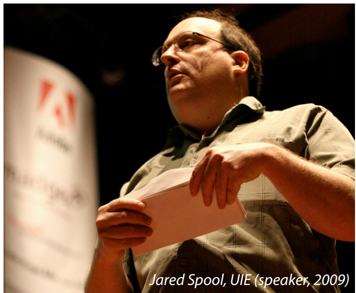
Jared Spool, UIE (speaker, 2009)

For the price of a single ticket, attendees will get to see some of the biggest names in the industry and choose from eight practical, hands-on workshop sessions. These will be spread across three tracks ( UX Fundamentals, Advanced Skills, UX Strategy and Management ) and cover everything from the basics of web usability and form design, through to advanced topics like Agile UXD, interactive wireframe creation and UX meeting facilitation.